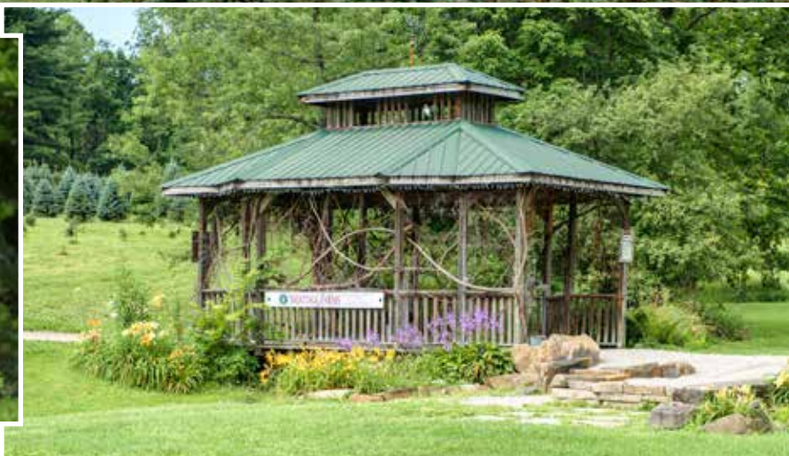
The Gazibo Bridge looking south